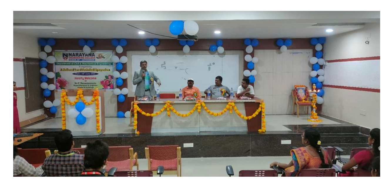
Principal delivering the lecture