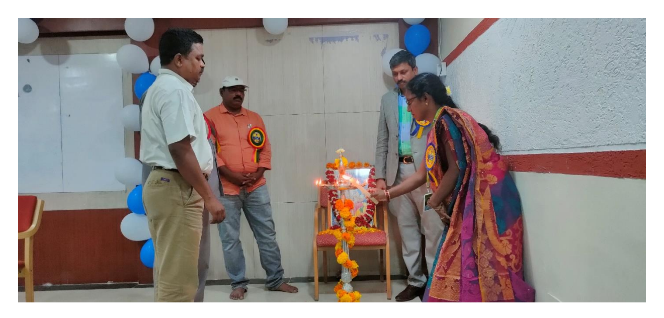
Lightening the Holy Lamp